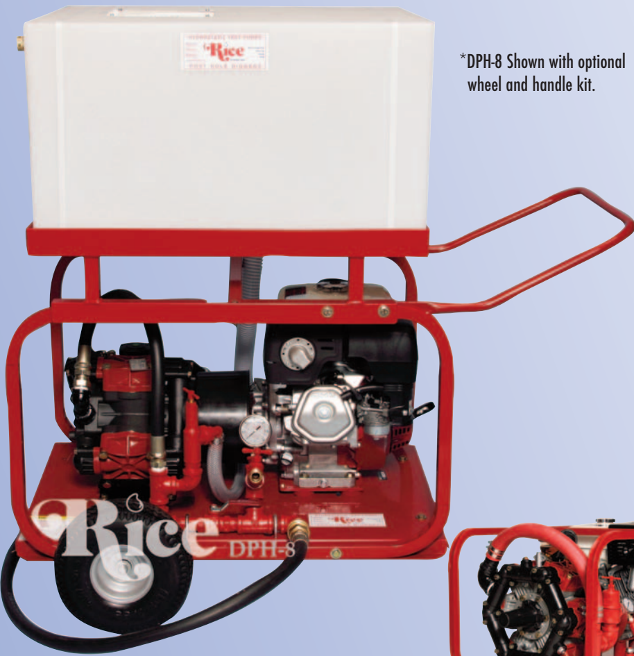
*DPH-8 Shown with optional wheel and handle kit.

The DP Series hydrostatic test pumps are large volume, medium pressure units, with flow rates up to 56 GPM and pressures up to 600 PSI. Designed to quickly fill and test lines up to 96" in diameter. Unique to the diaphragm pumps are their ability to handle up to a 10% chlorine solution, and can be run dry without damage to the pump.